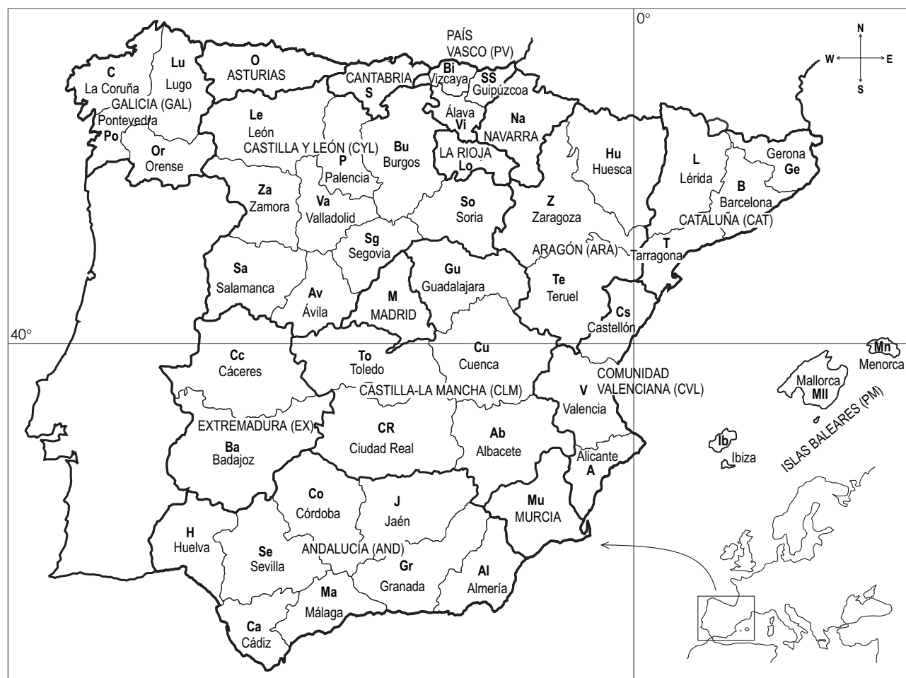
Figure 1. Location of the Iberian Peninsula and most of the Spanish provinces and regions (except for the Canary Islands).

Although most wild species used for food are native plants, introduced species that are now feral were also